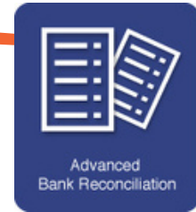
Advanced Bank Reconciliation

Nolan Business Solutions Enhancement Results