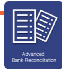
Advanced Bank Reconciliation

Eliminate manual and redundant processes, such as: 3-way reconciliation between Checkbook, GL and Bank Statement Deposit process for Cash Receipts