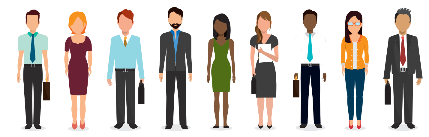
NetSuite delivers a number of roles that are pre-configured to ensure rapid adoption and quick speed of implementation: